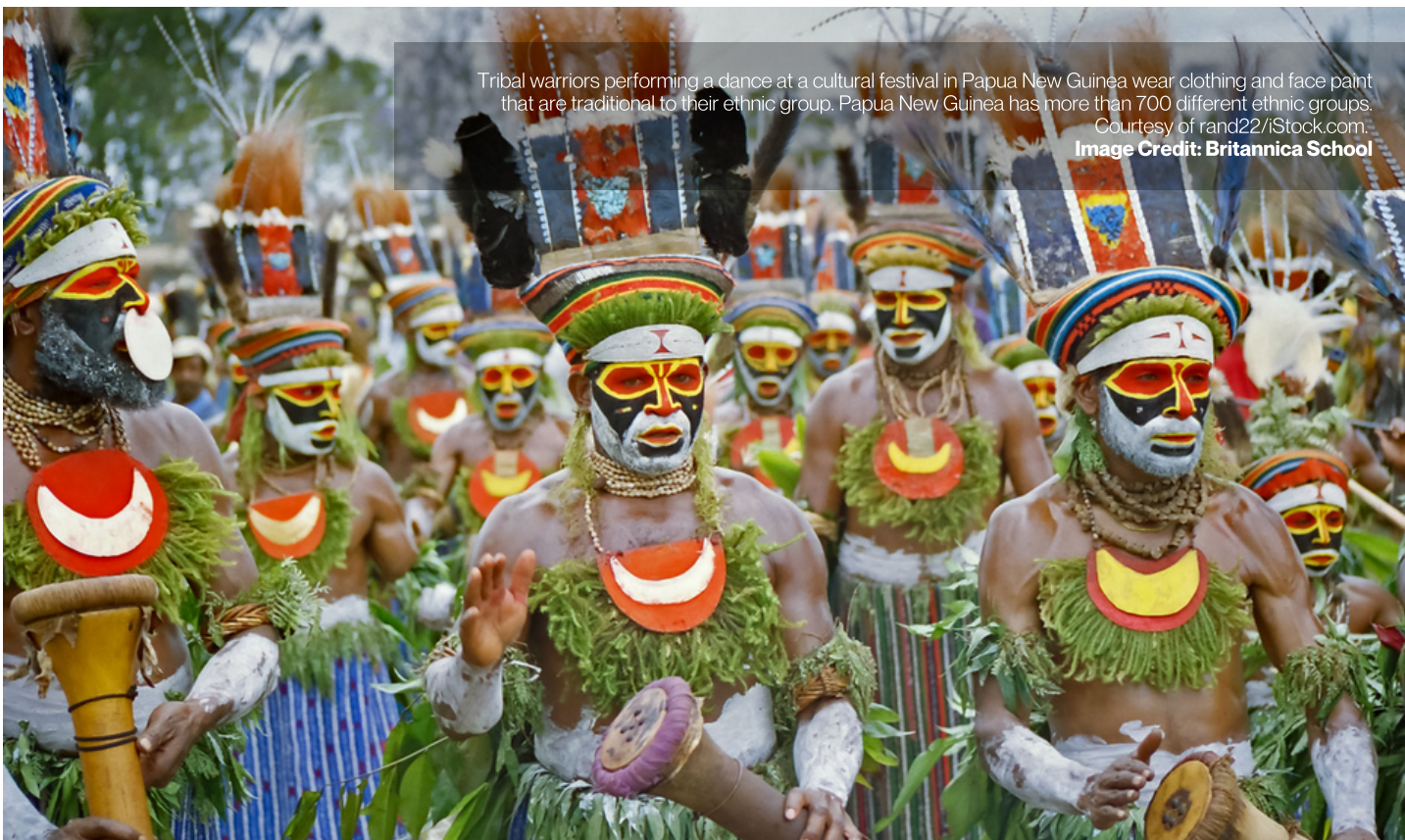
Tribal warriors performing a dance at a cultural festival in Papua New Guinea wear clothing and face paint that are traditional to their ethnic group. Papua New Guinea has more than 700 different ethnic groups.